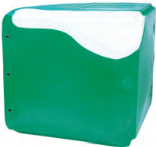
Cutaway of a float section shows it completely filled with expanded polystyrene foam that prevents water ingress in the event of damage.