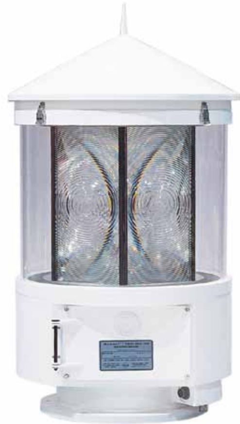
TRB-400 in IP65 housing

A compact, stand-alone, major light station beacon equipped with uniquely designed injection moulded acrylic dioptic fresnel lenses, the TRB-400 MaxLumina® Rotating Beacon is electric powered and lends itself to DC storage battery operation that can maintain a proper charge level through photovoltaic recharging from solar panels. Lens carousel, lampchanger and flasher, gearless direct drive motor and electronic control module are contained in a weathertight aluminum housing ( IP65) with cast acrylic glazing and stainless steel fasteners. Mounted on a light tower of proper height, the TRB-400 gives coastal shipping a 24 NM range light.