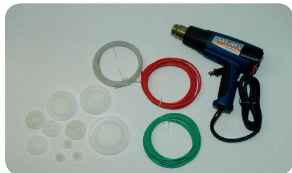
Tideland offers a variety of tool kits for minor repairs that may be ordered separately to assist in preserving buoys.